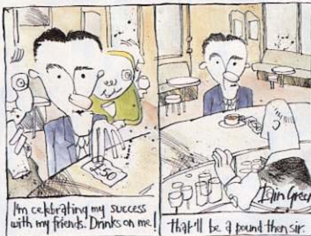
I'm celebrating my success with my friends. Drinks on me!

Mandelson may have inherited his political nous from Herbert Morrison — at least, that's the way his mother sees it. "Yes, they are sort of similar, I think... determined to see it through, but Peter's not ruthless. If he could